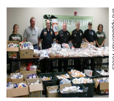
Drug Take-Back Event

To dispose of prescription and over-the-counter drugs, call your city or county government's household trash and recycling service and ask if a drug take-back program is available in your community. Some counties hold household hazardous waste collection days, where prescription and over-the-counter drugs are accepted at a central location for proper disposal.